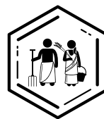
Culture and Food Traditions