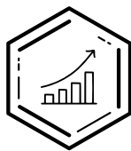
Circular and Solidarity Economy