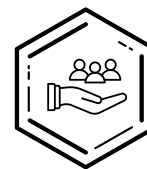
Human and Social Values